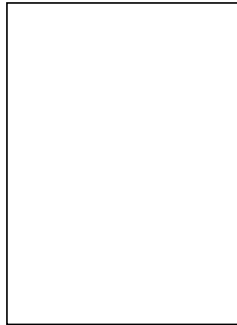
Sly Fox, 2006

Whether you're renewing your subscription or you want to become a new subscriber, now's the time to enjoy great theatre in Marin!